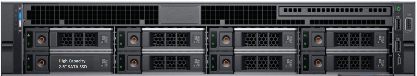
– Figure 2 – Front panel with bezel removed

2 The Q-SYS Core 5200 Enterprise Processor comes with an MTP-16 16-track audio player as a standard feature. Upgrades to 32, 64, and 128 tracks are available.