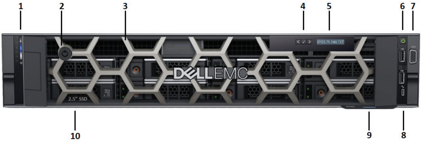
– Figure 1 – Front panel with bezel