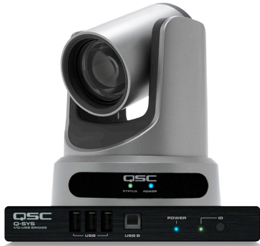
I/O-USB Bridge not included