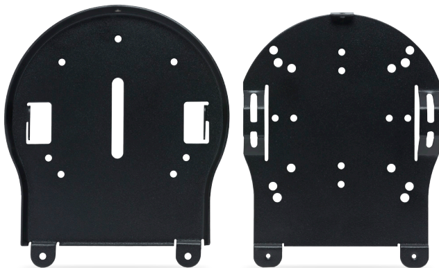
PTZ-CMB1 Ceiling Mounting Bracket